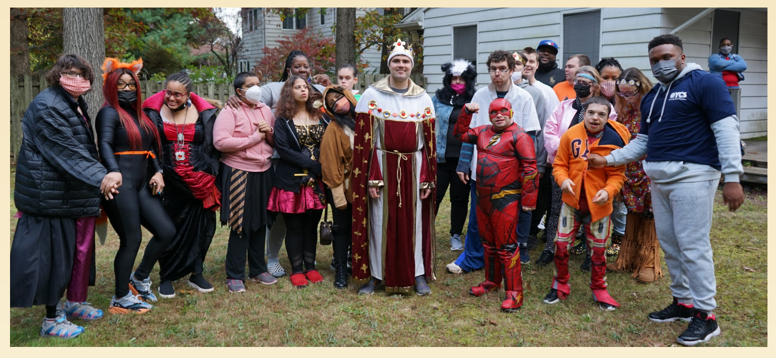
All the Sawtelle Northern Region DD homes gathered at the Amwell home to celebrate Halloween.