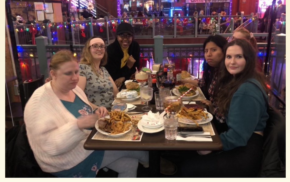
Sawtelle Morris Residents enjoyed an outing to NYC

are the 1st place winners of the Southern Region Holiday Door Contest! The SR HR department wanted to bring some holiday cheer to the staff with a friendly competition to put the administration building in the spirit of the holiday.